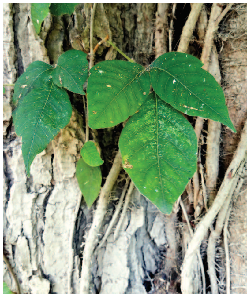
"Leaves of three, let it be," and, "Hairy rope, don't be a dope" help outdoorspeople recognize and avoid poison ivy

Poison ivy is by far Michigan's most common toxic plant. It grows prolifically in every county of the state and in virtual every habitat. When we teach our own children, as well as those in our outdoor education classes, we have them remember two ditties. The first is related to the fact that poison ivy always has three-leaf clusters and is, "Leaves of three, let it be!" Some other plants have three leaf configurations—including some berries—but it's always best to avoid any plant with this characteristic. The other saying we teach is, "Hairy rope, don't be a