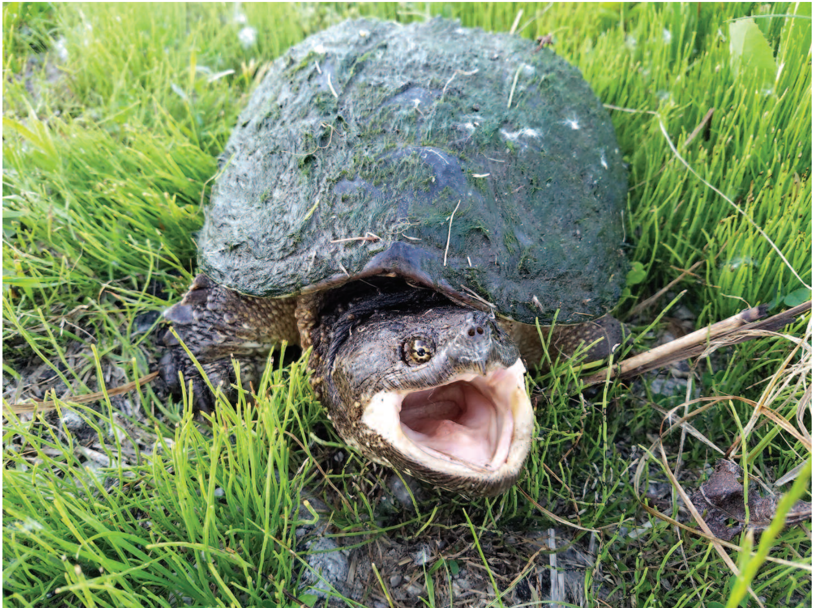
This old, "mossback" female snapping turtle showed little thanks when I moved her from the middle of US-31 near Crooked Lake in Conway!

If it's safe please consider getting out of your car to rescue a turtle from the road. It's best to place them safely on the side of the road where they were headed. In the case of snapping turtles—which can deliver a bite of 500 pounds per square inch—you should always handle them from the tail and back of the