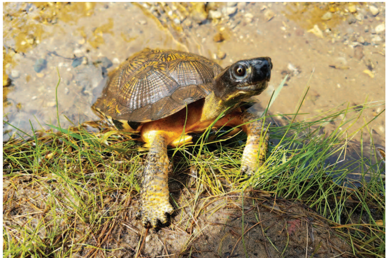
One of Michigan's rarest species are wood turtles, like this Au Sable River inhabitant.

Although it looks contagious you can't get poison ivy by touching someone else's rash. However, if the substance urushiol, which causes the rash, is still present on their clothing you can contract it that way. To be safe, make sure you wash all exposed skin areas and clothing with soap as soon as possible if you